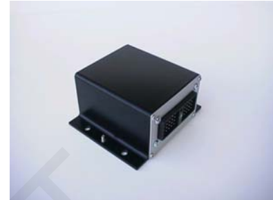
Sample of housing design

Description: The rugged controller features 1 CAN port for user-defined communications over the bus. Versatile and flexible, it accepts up to 4 analog inputs (0-5V, 0-10V, 0-20 mA, 4-20 mA or PWM), 2 fully isolated thermocouple inputs, 6 pressure or temperature sensor inputs as well as 6 digital inputs. A voltage reference can power an external sensor. Each input can be configured to measure the input value, and send the data to a SAE J1939 CAN network (CANopen on request). The controller provides 2 PWM or digital outputs to drive a proportional or on/off solenoid, 2 LED outputs and sets 2 Form C Relays. Diagnostics messages are provided over the CAN network for the status of inputs or outputs. Rugged IP67 rated packaging in addition to a wide ranging power supply input section suits power generation and large engine applications. During set-up, using the PC-based Axiomatic Electronic Assistant and an Axiomatic USB-CAN Converter, the operator can quickly configure the controller to suit a wide variety of applications. Alternatively, a RS-232 port is provided for user configuration via PC or for some diagnostic purposes.