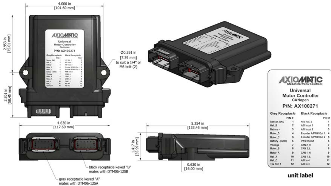
Figure 2.0 - Dimensional Drawing