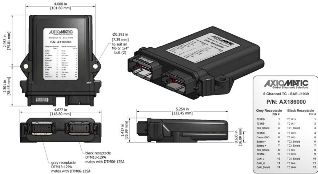
Figure 1.0 - Dimensional Drawing

Note: CANopen® is a registered community trademark of CAN in Automation e.V.