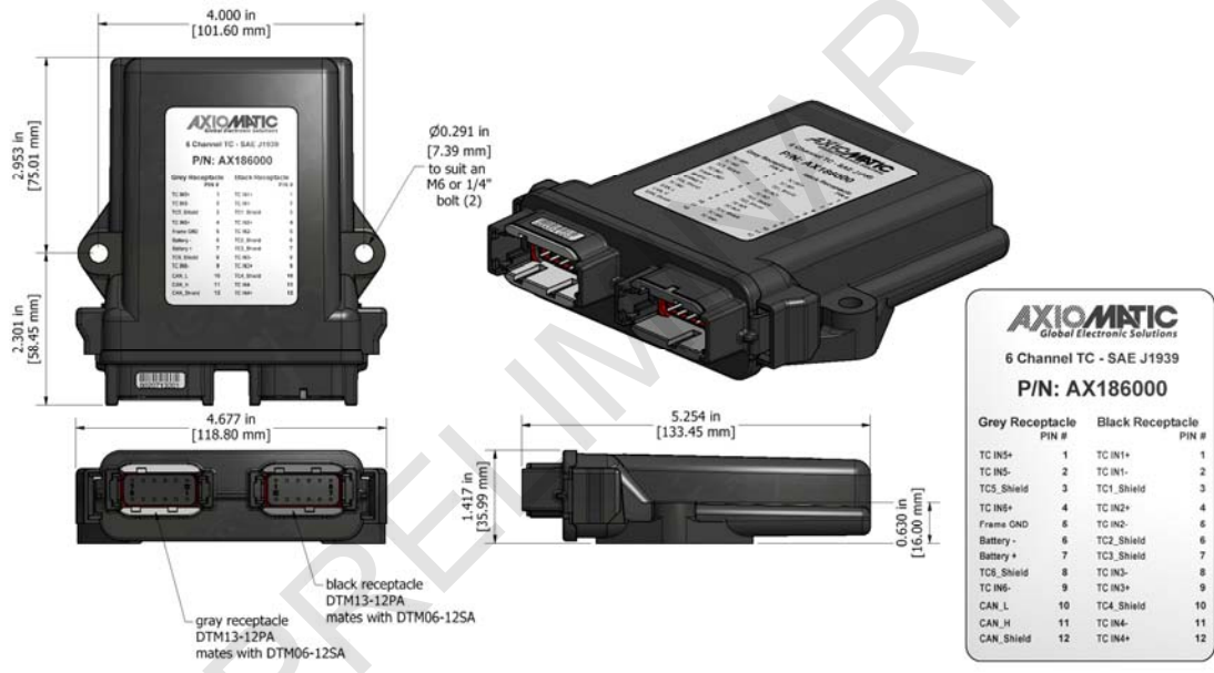
Figure 1.0 - Dimensional Drawing

Note: CANopen® is a registered community trademark of CAN in Automation e.V.