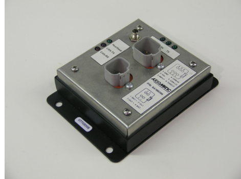
Rugged packaging for harsh environments

In electric fan drive applications, a loss of CAN bus communications has the controller output operate at a default value that turns on the motor to allow a cooling fan to operate until communications are re-established or a time-out period elapses.