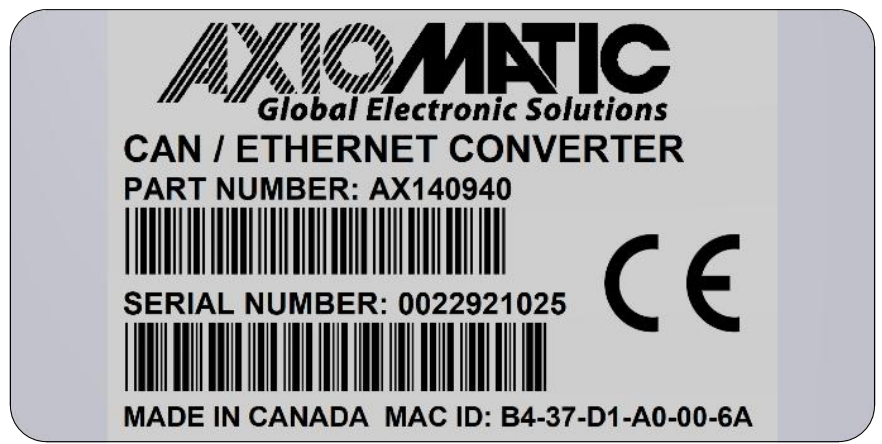
device plate label